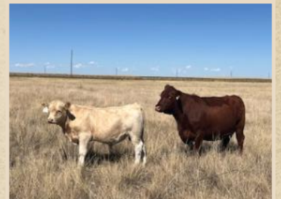
Lot 59 with his Dam