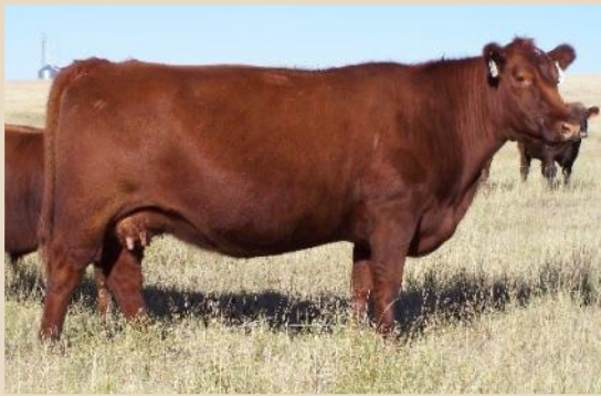
AXTELL WSTRN PRD 310

Great Grand Dam of Lot 10 Grand Dam of All Endorse 8935 Bulls.