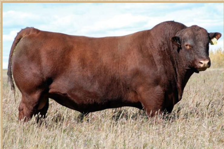
RED FLYING K MAX 159Y

Aromax has been used by us for many years. His calves are typically very fancy with good calving ease. His daughters have proven to be very good young cows in our herd.