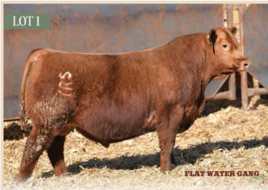
RIDGE CRAFTSMAN 3620

COMING SOON... We look forward to seeing the next calf crop featuring these herd sires. Craftsman was the much talked about Lot 1 in last year's Flat Water Gang Sale. Boxer is the bull that we co-own with Select Sires—Argentina. He stands at World West Sires in Montana and has garnered a lot of attention there. Semen Available