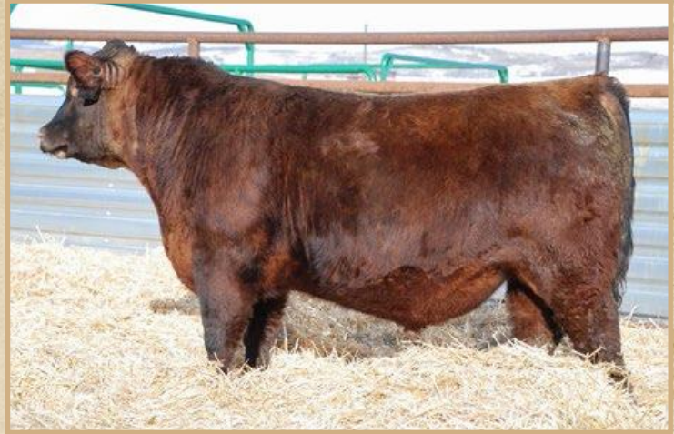
RED SSS ACTION 907G

Action was purchased from SSS in Canada. He adds frame, performance and his daughters have top notch udder quality. SEMEN AVAILABLE