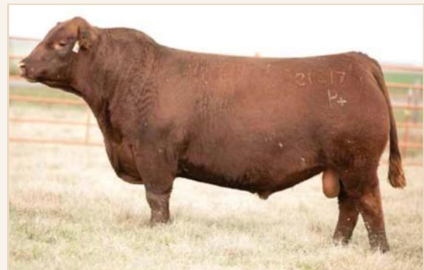
DUFF RED BOXER 21217