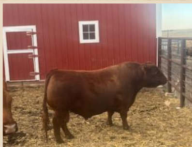
Boxer came home from World West Sires to breed cows here this summer. We look forward to his calves hitting the ground now. His maternal brother sells in the sale as Lot 19.