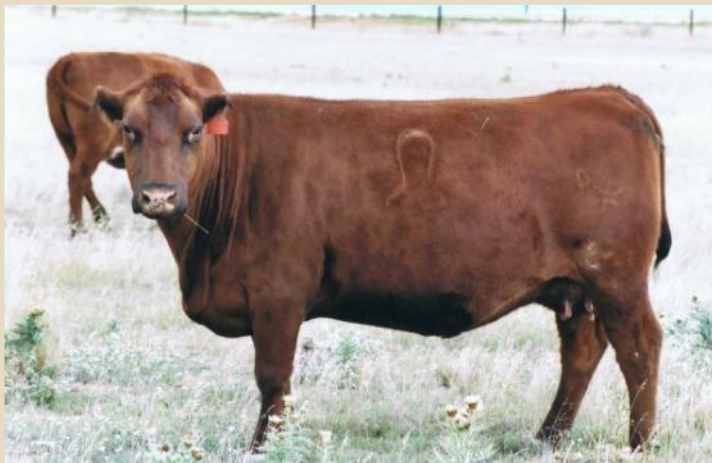
LCHMN SYRINGA F1080

The grand dam of this heifer is a Donor for Little Cedar Beef in Iowa. She will be a smaller cow, but should be productive.