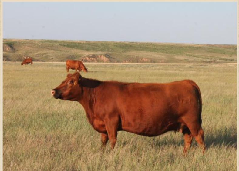
AXTELL AMBER 040

Great Grand Dam of Lot 10 Grand Dam of All Endorse 8935 Bulls.