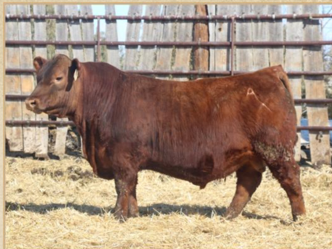
AXTELL TKO 2418

We retained TKO to continue the Knock Out line. He is very moderate, very deep and wide. We used him on cows, but his calving ease was great, so we moved him to the heifers this past year. He stamps a type in all of his calves. SEMEN AVAILABLE