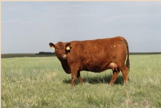
AX LANA 02-616

Grand Dam of Lots 4 and 36. Great Grand Dam of Lots 29 and 31.