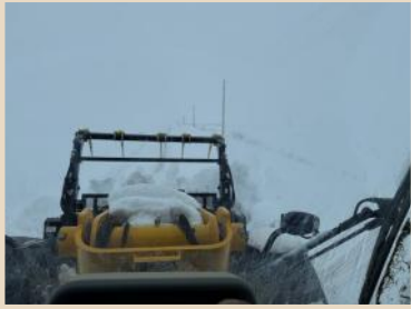
Winter came in full force in November this year leaving behind over 30 inches of snow.