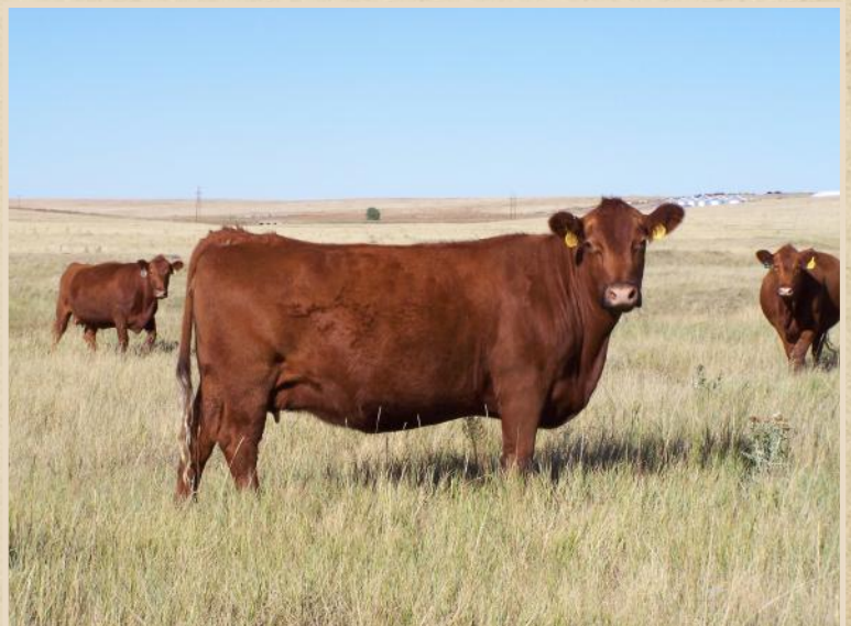
AX LANA 205

Grand Dam of Lot 53 Her influence is felt throughout the sale