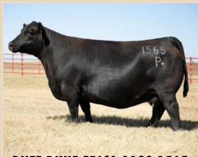
DUFF DIXIE ERICA 1120 1565 Dam of Red Duff Boxer 21217 and Lot 19