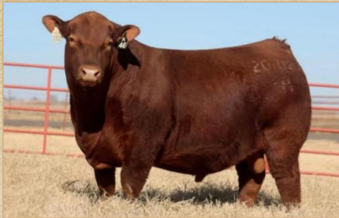
DUFF BOSS 20102