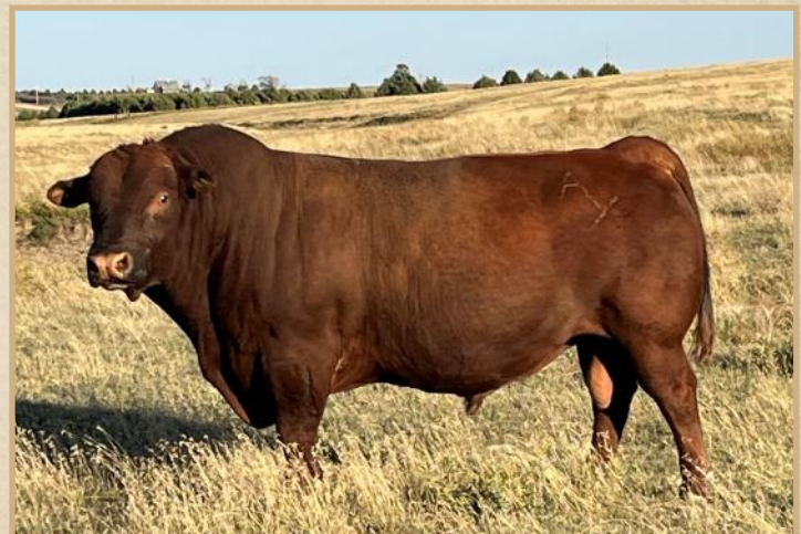
AXTELL RED KNIGHT 6249

2024 was the last breeding season for Red Knight. He bred cows for seven years here. He was one of the heaviest muscled bulls we've had. He was moderate framed and very easy keeping. I never saw him thin. His influence is felt throughout the sale.