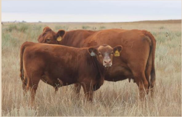
AXTELL ENCINO 91-041 Great Grand Dam of Lot 69

The first Widescreen heifer to sell and she's a nice one. She's moderate framed, deep bodied and broody. She's out of a good young cow with excellent fleshing ability.