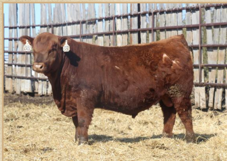
AXTELL WIDSCREEN 2032